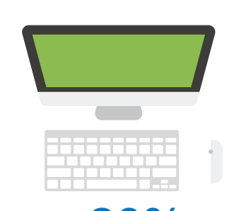
+80% of our contact is now online due to channel shift.

Connected with colleagues at local District and County Councils to ensure a streamlined service to support our customers.