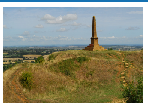
Ham Hill National Heritage Lottery Fund Development Phase funding secured and project progressed throughout the year.

£50K funding from the Cultural Recovery Fund to support extra staffing and management at Ham Hill through the Covid response and recovery phases.