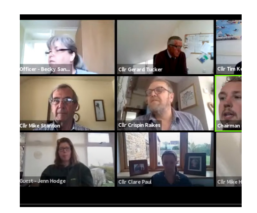
Facilitated virtual council meetings during the Covid-19 pandemic, resulting in better attendance to these meetings.